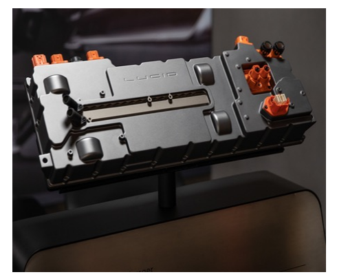
Bidirectional Charging with "Wunderbox"