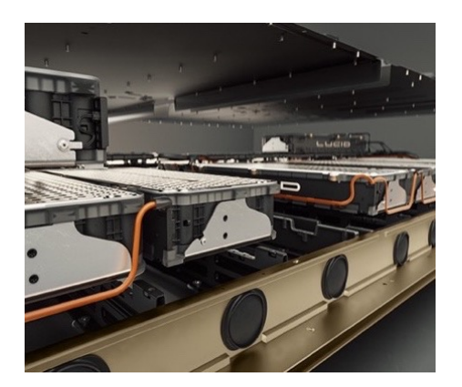
Scalable and Modular Battery Pack Built on Race Experience

Ultra-efficient, proprietary powertrain technology and advanced software and battery management system (BMS)