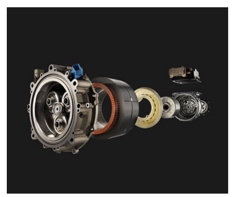
Motor & Integrated Transmission