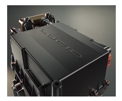
State-of-the-Art, High Voltage Inverter