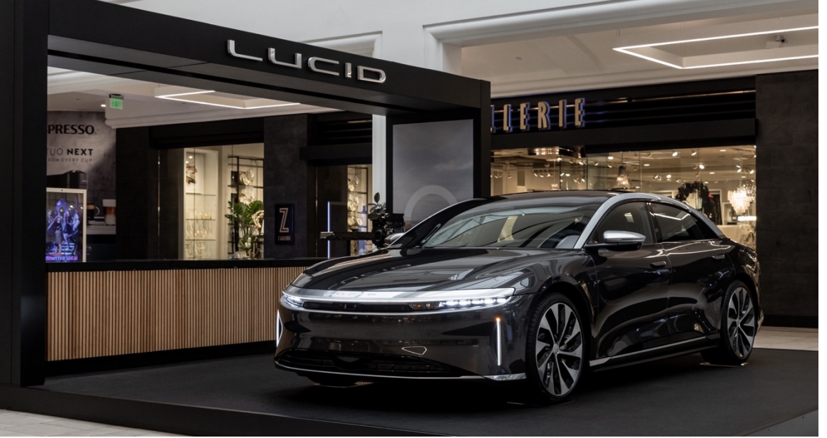
Pop-up Studio, Sherman Oaks Galleria, CA