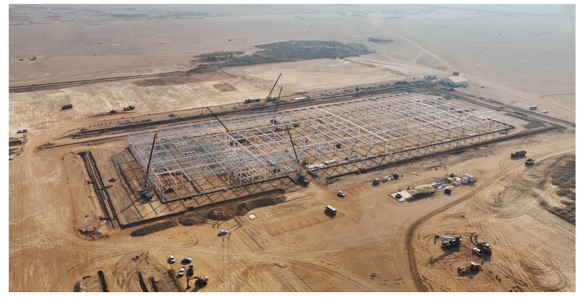
AMP-2, KAEC, Saudi Arabia - October 2022